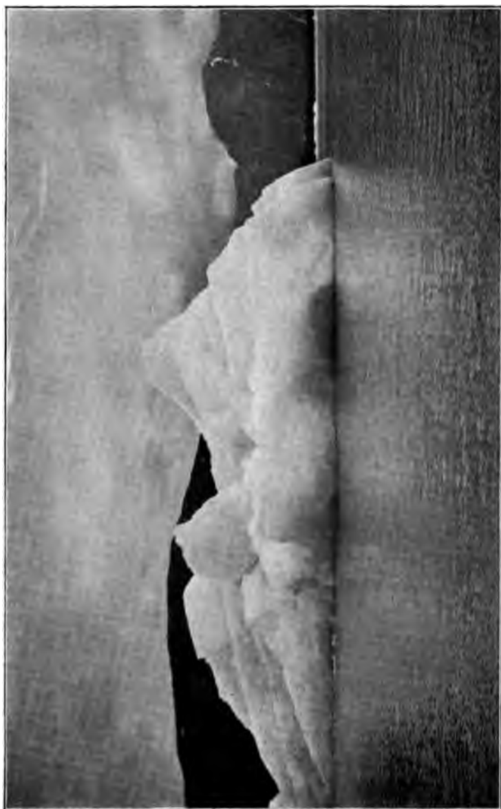
FLOATING ICEBERG, TAKU INLET